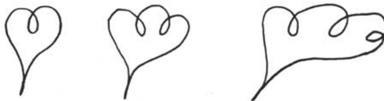
Symbols in another illustration

Illustration titled "The Feedback Process": may be an illustration of tire tracks of a car parking and leaving a parking place on a steep hill.