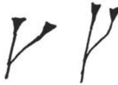
Typical "notes" in an illustration